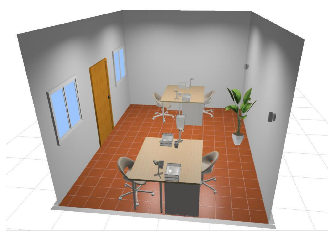
Office #2 and #3 for 5 people